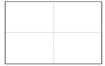
A4 paper divided into 4 postcards

You can cut A4 sized paper into quarters to get this size (or A5 paper in half). Use either thick art paper or thin cardboard.