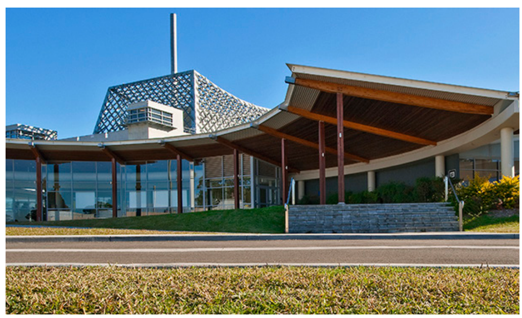
Image of ANSTO OPAL Reactor Building - Lucas Heights, Sydney Australia

A summary session will be held on 9 December 2021 to review the activities and conclusions drawn at the meeting that will be documented in a final report. Directions for future research will be also discussed and presented.