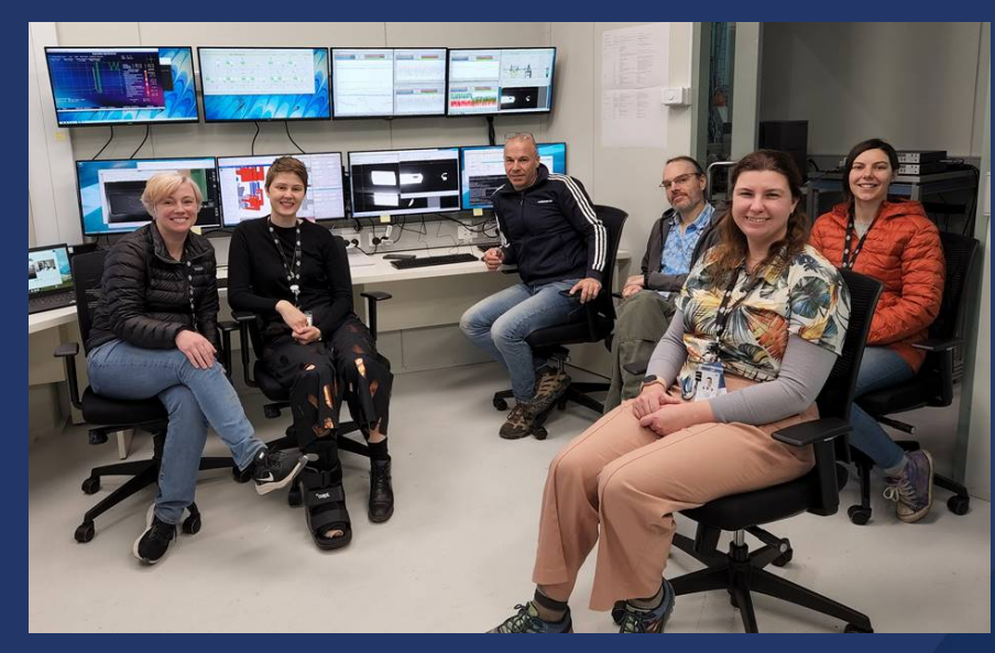
MEX and XAS staff with first light on the monitor in the background