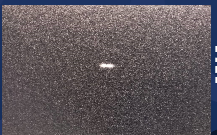
First glimpse of the monochromatic beam in the MEX-1 Experimental hutch