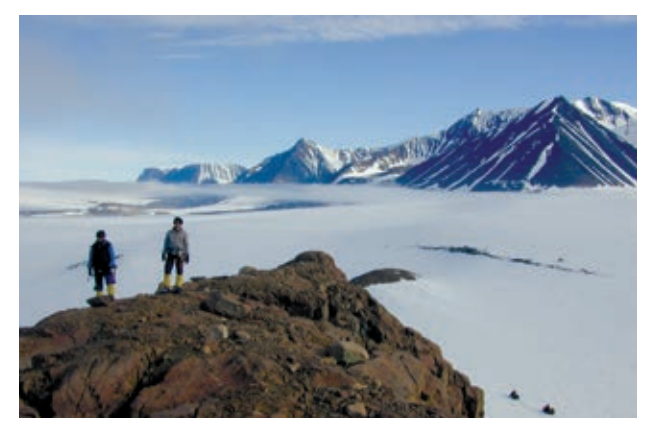
ANSTO's research on Antarctic ice sheets is helping understand the impact of climate variability on global sea levels.

CAS, which is partially funded through NCRIS, consists of four megavolt ion accelerators - the 2MV Small Tandem for Applied Research (STAR), the 10MV Australian National Tandem Research Accelerator (ANTARES), a 1MV low energy multi-isotope accelerator (VEGA) and a 6MV tandem accelerator (SIRIUS) - with 17 beamlines and end stations, 10 ion sources and a suite of sample processing laboratories.