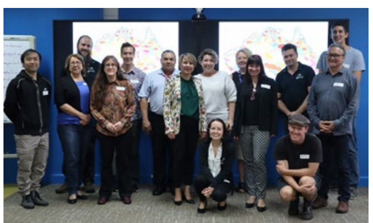
Aboriginal students from Endeavour Sports High School visit.