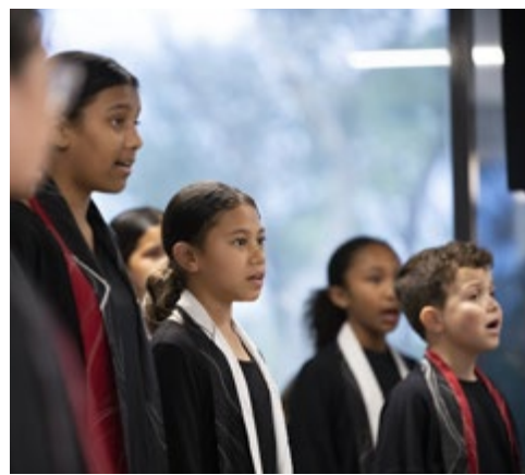
Cairns-based Gondwana choir sang the national anthem in Dharawal at the launch event.