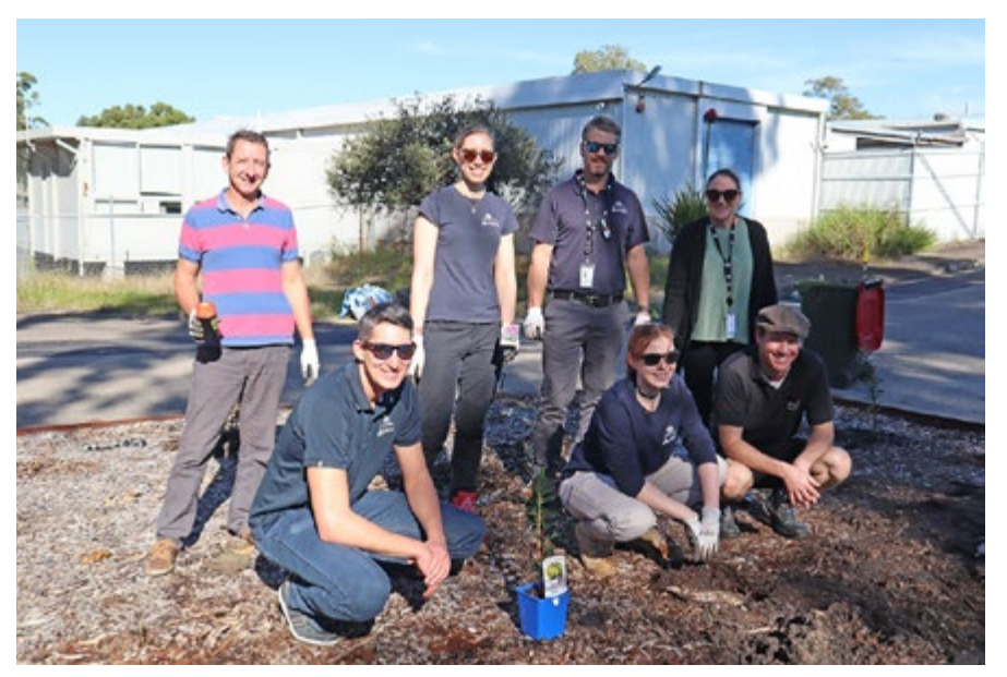
Planting at Indigenous garden Lucas Heights.