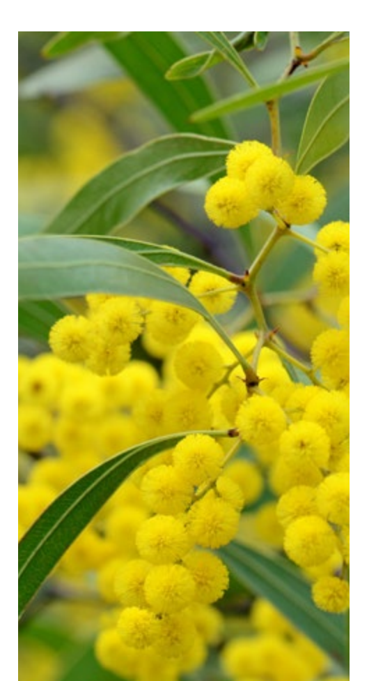
alax Science, Ingurus yeSustainabiliffy