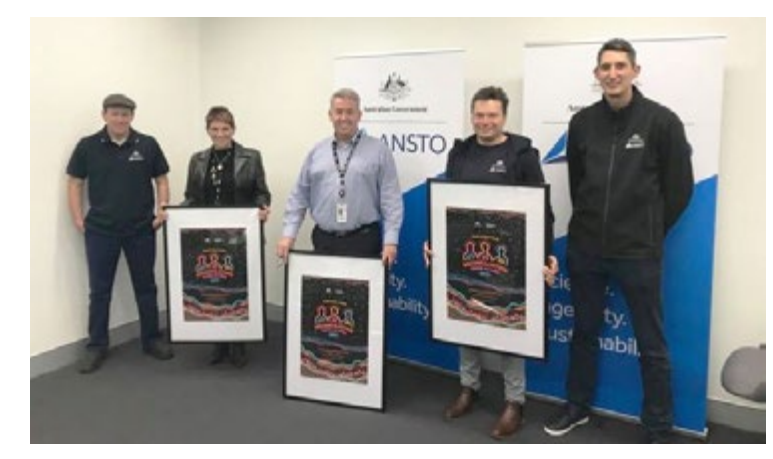
Staff acknowledgement award 2021.