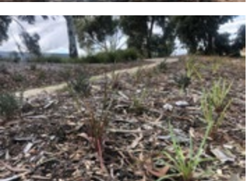
The Meeting Circle can be used by staff as a meeting space.