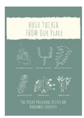
Bush tucker cookbook.