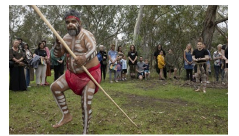
Traditional song and dance by Gumaraa at launch of Dharawal learning resource.